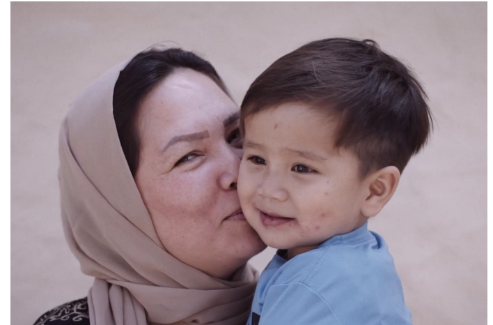
Clients of Jewish Vocational Services (JVS), one of the organizations receiving operational support from the Jewish Community Foundation's Community Legacy Fund

The Community Legacy Fund is comprised of permanent endowments from which grants are awarded to agencies whose applications are reviewed and evaluated by the Foundation's Grants Committee and Board of Trustees. The Foundation's Grants Committee is a dedicated group of lay leaders who thoroughly review each application and engage in thoughtful dialogue about how to best allocate resources to make the most meaningful impact. In addition to its core granting cycle, the fund has an innovation/emergency cycle that supports high-quality, new programs that provide an innovative approach or solution to an existing or emerging community need, or respond to financial or humanitarian emergencies.